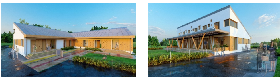
Figure 4. Improved renovation of kindergarten, 3D view.

According to the improved solution, a single-pitched pitched roof was designed with a slope from south to north. The complete load-bearing structure is wooden. Transverse posts are attached to the massive wooden rafters from the upper side with thermal insulation installed between them and between the rafters as well, thus reducing the thermal bridges in the roof. According to the improved solution, it was planned to demolish the parapet and maximize the opening on the south and west sides, achieving a direct connection with the courtyard of the building, improving both the spatial and functional solution of the kindergarten. Gallery upgrading was planned so that the building on the south side has two floors and opens to the south to the maximum, and closes to the north, lowering the roof again to the level of one floor. In the extended part, i.e., the gallery, the play of dimensions and position of the opening was used as an architectural-visual element, creating a playful facade, contributing to the atmosphere of the interior space, Figure 4.