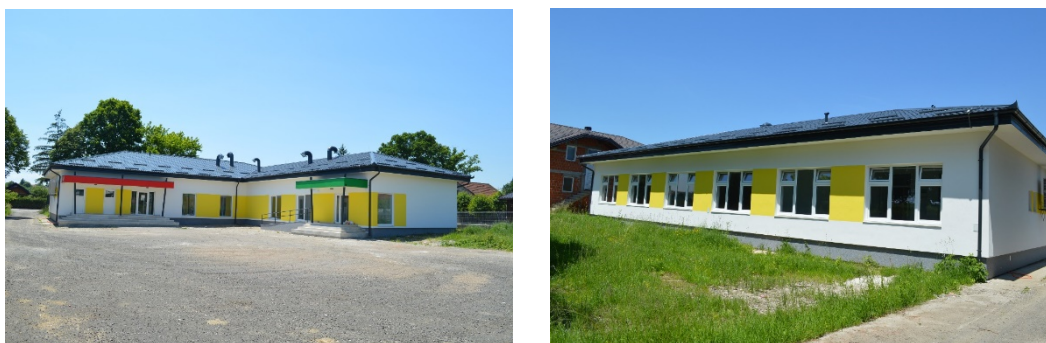
Figure 2. Standard renovation of kindergarten was realized in May 2021.

The building is made in a classic masonry system with brick walls 25 cm thick and brick reinforcements in the form of extensions 38 cm thick, about 100 cm long. At the corners and half of the span of the sides, there are vertical circles 25x25 cm connected by horizontal beams 30 cm wide and 25 cm high, i.e., 40 cm, along the facade walls. The ceiling is made of wooden beams - ceiling tiles 18/20 cm; there is a board edging and the reed plaster on the lower side. A wooden plank was also made towards the attic on the upper side. Designed solution - standard renovation envisages construction of a contact facade with expanded polystyrene insulation ( \lambda=0.042 [W/mK]) 15 cm thick and a final layer of silicate-silicone precious plaster, then windows with plastic frames and three-layer thermal insulation glass with low-E coating and filled with Argon (average U_w=1.10 [W/m 2 K]). The floor is covered with waterproofing with 10 cm of extruded polystyrene ( \lambda=0.035 [W/mK]) over which the protection from PVC foil is placed, and then the cement screed with the final layer of epoxy. As the roof structure is above the unheated attic, the installation of mineral wool was planned and carried out ( \lambda=0.038 [W/mK]) in a thickness of 20 cm on the mezzanine structure under the unheated attic, Table 1.