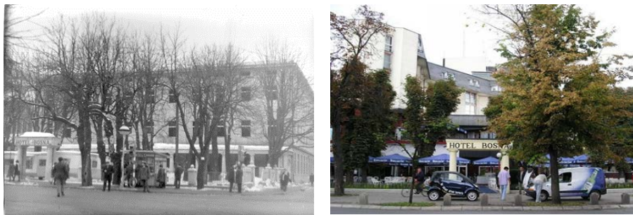
Figure 4. 5. Hotel Bosna - before and now

Preserved buildings and places contribute to protection of recognizable images of the city. A connection between branding and identity is certainly based on preserved remains of building heritage, as well as on its historical events and legends. There is an opinion that "meetings with the city are realized through perception and images" (Kavaratzis, M. 2004. p. 62) and due to this reason spatial dimension of branding is of a great importance. The city's image originates from a physical reality and is based on well-worn prejudices, desires and memories that take shape in the collective memory" (Kavaratzis, M. 2004. p. 62). In the case of the City of Banja Luka, a mixture of different cultures and tradition that influenced the city is very important. There is also a significant number of tangible remains from the ancient times to the contemporary period. Heritage from the Ottoman period and architecture between two world wars might have the greatest importance since these are the periods when the City of Banja Luka was thriving the most.