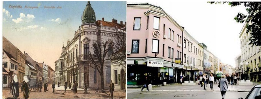
Figure 2.3. Gospodska street - before and now

Edges are important elements contributing to the experience of the city since they represent significant communication points, whether they have extension and are developing into square or they remain as a connection of two communication directions. The most important examples are the Palas Hotel, which emphasizes a position of the corner by dapping the ground floor, Hipotekarna Bank, which stresses a location where it is placed by its architecture, entrance and sculpture, Vakuf Palace, square at the National Theatre, Krajina Square, whose irregular shape provides a specific type of attraction and it represents a meeting point and location of important city events, and there is also a street corner where the National Assembly is placed and an old Government building as a specific spatial dominant. Furthermore, it is important to emphasize Car Dušan Boulevard, which represents a border between oriental and European part of the city. The Boulevard was formed after the stream Crkvena was shutdown. Even though this eliminated the division between oriental and European part, the presence of ambient wholeness Hanište with Ferhat Pasha Mosque has remained an important witness of oriental part of the city.