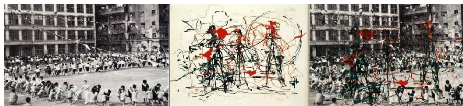
Figure 1. Life - open public space vs. Jackson Pollock's untitled painting

Noting down the main characteristics which a certain city site should possess in order to be classified as a space with the satisfactory level of "life", we come to the following conclusion: in order to enable an individual to experience the city space, it is mandatory to get the rest of the users animated and activated. In order for that atmosphere to be realized, it is necessary to provide the adequate space structures and contents, which