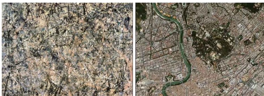
Figure 2. "Lavander Mist" by Jackson Pollock and physical structure of Rome, Italy - similarity and complexity