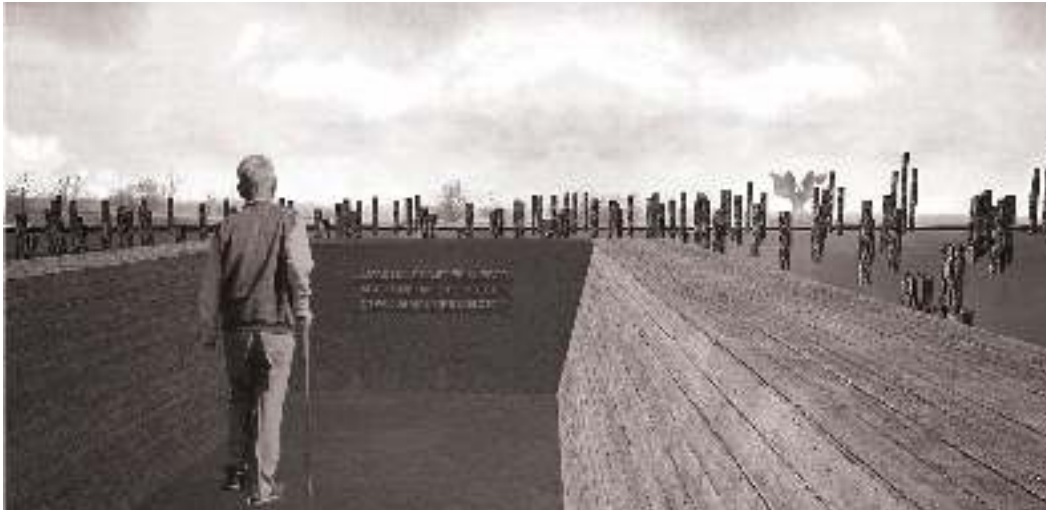
Figure 4 Memorial Scaffold of Fear (competition proposal), 3D visualization