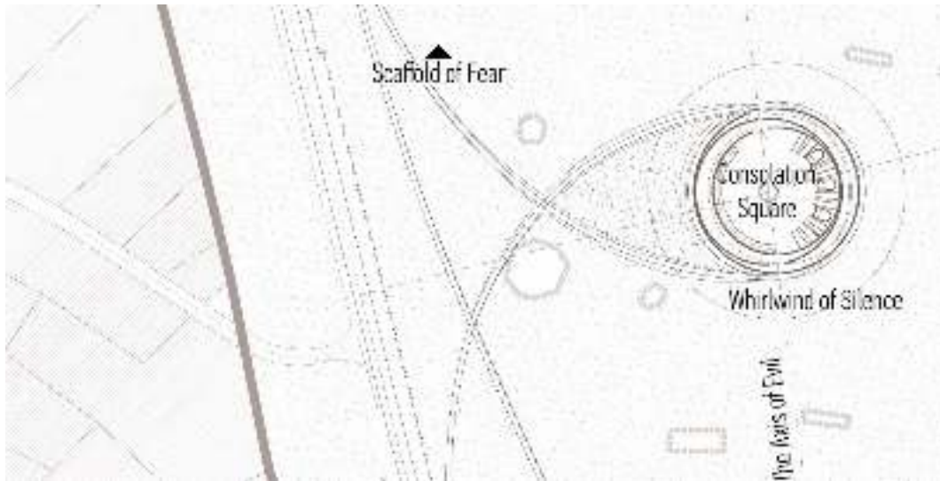
Figure 3 Memorial Whirlwind of Silence (competition proposal), plan

Whirlwind connotes the "Survival of life and death, signifies a state in which one neither can live nor die ... It can only be turned into a circle or vortex." The etymology of the word vortex indicates the verb spin, which connects with the spindle word. This etymological series suggests that the whirlwind, in addition to bringing fear and leading to death, simultaneously points to the source of life, on weaving and creation; therefore, the theme of the vellum is also the cyclical movement of life, where life ends and it reappears. [14]