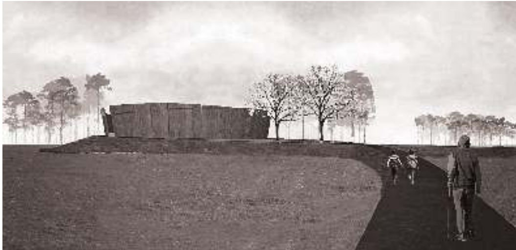
Figure 2 Memorial Whirlwind of Silence (competition proposal), 3D visualization

"Gradina", site, is the term in architecture describing difficult to access fortified site of bigger or smaller dimensions; it may be applied to almost all high settlements and often to fortifications on the swamp land and in the plains. At the same time, the mound is being built and in order to drain the ubiquitous water in the field during the high water level of the groundwater.