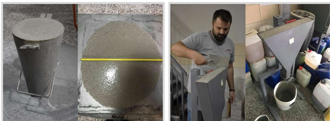
Figure 2. Flowability measurements using the slump-flow test (left), fresh concrete during V-funnel test (right)