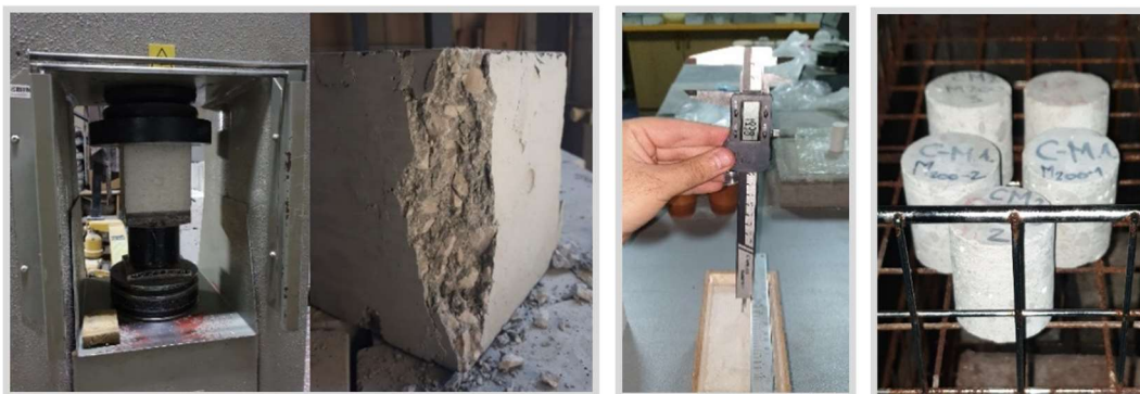
Figure 4. Compressive strength test (left), freeze/thaw surface resistance with a de-icing agent (middle), samples for freeze/thaw resistance (right)

In Figure 4, the tests conducted on the hardened concrete are shown.