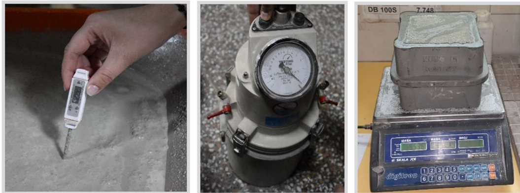
Figure 1. Measuring of temperature (left), entrapped air content (middle) and density of fresh concrete (right)

In Figures 1-3, the tests conducted on the fresh concrete are presented.