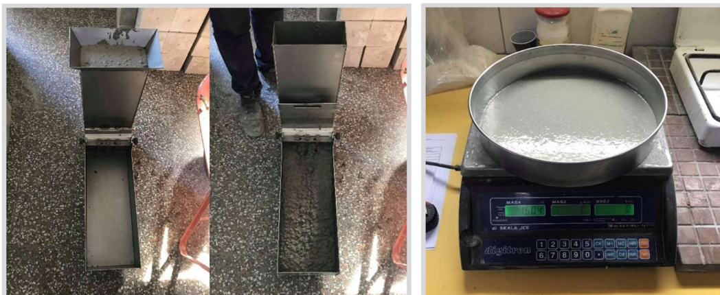
Figure 3. Passing ability testing, using the L-box (left), segregation resistance testing (right)