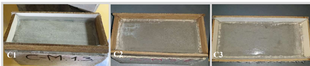
Figure 6. Surfaces appearance after 25 f/t cycles with de-icing salt

* Note: 0 – without scaling ( L \approx 0 \text{ mg/mm}^2 , HFTR-S \approx 0 \text{ mm} ), 1 – a little scaling ( L \approx 0.2 \text{ mg/mm}^2 , HFTR-S \approx 1.0 \text{ mm} ), 2 – medium scaling ( L \approx 0.5 \text{ mg/mm}^2 , HFTR-S \approx 4.0 \text{ mm} ), 3 – severe scaling ( L \approx 1.0 \text{ mg/mm}^2 , HFTR-S \approx 10.0 \text{ mm} ).