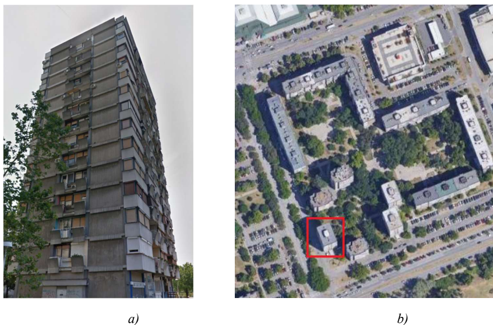
Figure 2. a) Northwest facade of the object b) location of the object in urban building block

The UAV dataset was acquired in the urban area of Novi Sad, Serbia, approximately 45^{\circ}14' 27'' N and 19^{\circ} 50' 17'' E. The case study focused on the northwest facade of a high-rise (13-storey) residential building built in 1972. The location of the study area and building is depicted in Figure 2. From the first to the 13th floor, the northern facade of the building is identical in appearance, with windows on the left and right edges of the building and a terrace in the middle of each floor. While on the ground floor in the middle of the building, there is an abandoned transformer station.