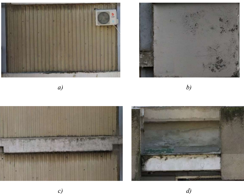
Figure 5. Cracks on the facade

During the analysis of the orthomosaic, cracks found on the facade are shown in Figure 5. It can be concluded that the cracks appeared on different parts of the facade. However, the procedure of manual detection of cracks on the orthomosaic is time consuming and laborious. The detection and classification of cracks largely depend on the individual expertise and experience of the surveyor and lead to data redundancy. In addition to the manual analysis of cracks on the facade, there are tools for automatically detecting cracks on the orthomosaic facade, such as the AIM method [23]. After detecting cracks on the georeferenced orthomosaic, it is possible to determine the coordinates of those cracks on the object in the global coordinate system, in this case, EPSG: 3909. Since a geodetic network and GCPs with an accuracy of several mm have been established, it is possible to mark the cracks on the object with very high precision.