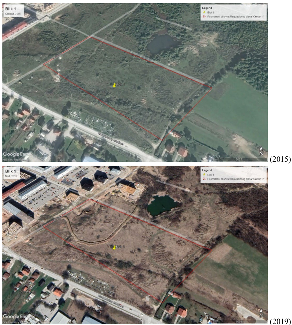
Figure 1. Residential settlement Block 1 in Istočno Novo Sarajevo before planning and construction

The Block 1 residential complex is located in Istočno Novo Sarajevo and is bounded by Dečanska street and streets 5.1 and 4.1 (names defined in the design documentation of the municipality of Istočno Novo Sarajevo). Dečanska street is a primary urban road whose cross section is composed of two traffic lanes, as well as bicycle and pedestrian paths separated from motorized traffic by a green belt. Streets 4.1 and 5.1 are secondary urban roads with a similar cross section as Dečanska Street, without established bicycle paths, but with a reserved area for them. In Figure 1, it is possible to observe the appearance of the block (red line) before occupation, i.e. the preparation of the planning document and the very beginning of construction through two stages - 2015 and 2019 - with noticeable changes of the surrounding in a relatively short period of time.