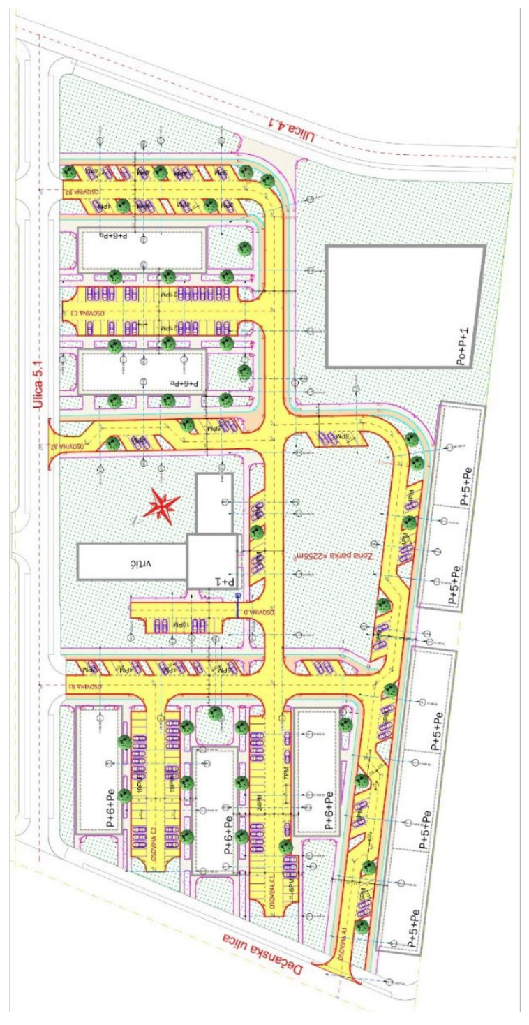
Figure 3. Layout of traffic facilities in Block 1 according to the proposed solution [5]